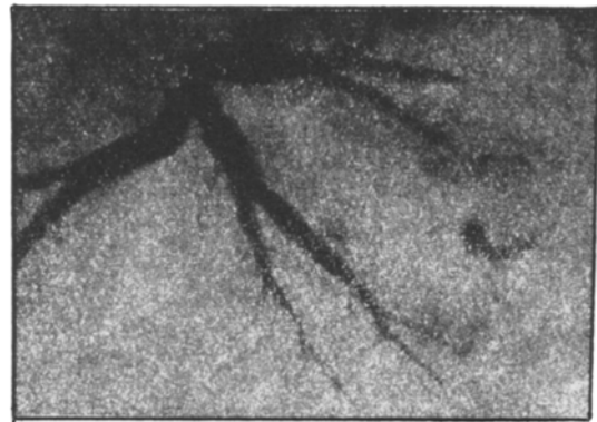
Fig. 2. Postmortem bronchogram of the dog Neron 39 days after operation. Cylindrical bronchiectases in the lobar and segmental bronchus.