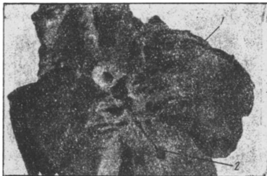
Fig. 3. Dilatation of the lumen of the lobar bronchi (1, 2) in a gross specimen of the lung of the dogs Al'fa (on the 45th day after operation).

with a cork, an obturation atelectasis developed in the lung. Five dogs underwent operation.